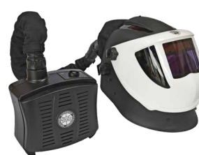
DW7000XL comes with battery powered air respirator.